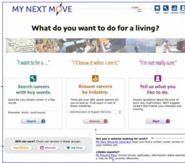
Speak Spanish? Take advantage of Mi Proximo Paso

Job Prep groups together careers that need the same level of experience, education, and training.