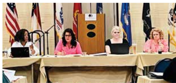
Veterans Service Officers attend the Annual NC DMVA VSO Conference.

Special thanks to all NC DMVA staff and partners.