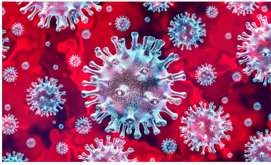
A visualization of the Coronavirus as it appears under a microscope.