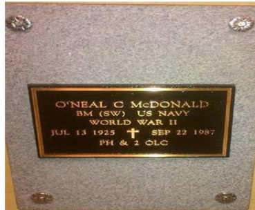
BRONZE NICHE (Z)

This niche marker is 8-1/2 inches long, 5-1/2 inches wide, with 7/16 inch rise. Weight is approximately 3 pounds; mounting bolts and washers are furnished with the marker. Used for columbarium or mausoleum interment. Also provided to supplement a privately-purchased headstone or marker for eligible Veterans who died on or after November 1, 1990 and are buried in a private cemetery.