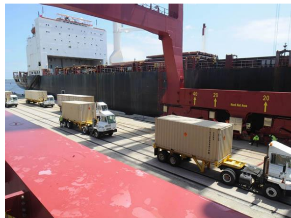
A rare peek at one of many MOTSU docks