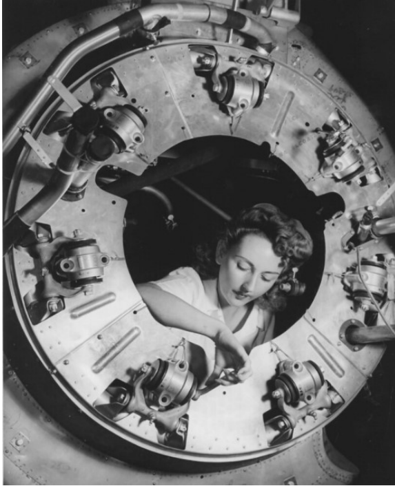
Part of the cowling for one of the motors for a B-25 bomber is assembled in the engine department of North American's Inglewood, Calif. plant., 10/1942

hardworking souls through the lens of many photos from the National Archives.