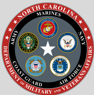
North Carolina Department of Military and Veterans Affairs

The North Carolina Department of Military and Veterans Affairs (NC DMVA) supports both active and reserve uniformed military personnel and their families; military installations and communities; and military veterans and their families in North Carolina. The Department seeks to provide timely and responsive engagement to enhance NC's current military and veteran friendly environment. In addition, the Department also seeks to foster and promote business, technology, transportation, education, economic development, and healthcare for the above communities. Lastly, the Department works to accomplish these services by providing assistance and coordination between the Federal Government, the State of NC, its political subdivisions, and collaborative and supporting agencies.