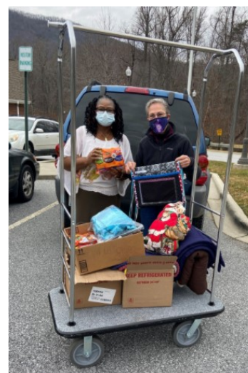
Hickory Elks Lodge 1654 brought donations including snacks, warm pullovers, board games, and an Atomic Patriot Arcade Basketball set for the Black Mountain residents.