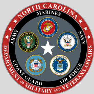
North Carolina Department of Military and Veterans Affairs

The North Carolina Department of Military and Veterans Affairs (NCDMVA) supports both active and reserve uniformed military personnel and their families; military installations and communities; and military veterans and their families in North Carolina. The Department seeks to provide timely and responsive engagement to enhance NC’s current military and veteran friendly environment. In addition, the Department also seeks to foster and promote business, technology, transportation, education, economic development, and healthcare for the above communities. Lastly, the Department works to accomplish these services by providing assistance and coordination between the Federal Government,