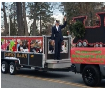
Our State Veterans Home in Black Mountain received the First Place trophy in the Christmas Parade with their Polar Express themed float.