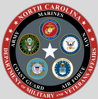
North Carolina Department of Military and Veterans Affairs

The North Carolina Department of Military and Veterans Affairs (NC DMVA) supports both active and reserve uniformed military personnel and their families; military installations and communities; and military veterans and their families in North Carolina. The Department seeks to provide timely and responsive engagement to enhance NC's current military and veteran friendly environment. In addition, the Department also seeks to foster and promote business, technology, transportation, education, economic development, and healthcare for the above communities. Lastly, the Department works to accomplish these services by providing assistance and coordination between the Federal Government, the State of NC, its political subdivisions, and collaborative and supporting agencies.