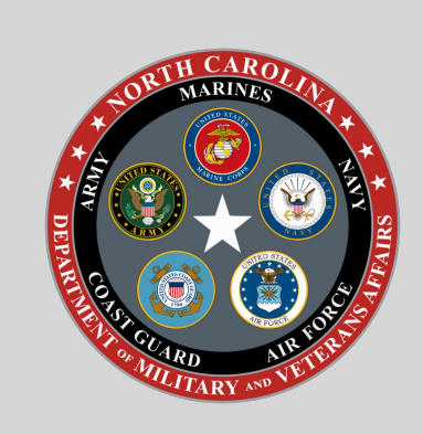
North Carolina Department of Military and Veterans Affairs

The North Carolina Department of Military and Veterans Affairs (NCDMVA) supports both active and reserve uniformed military personnel and their families; military installations and communities; and military veterans and their families in North Carolina. The Department seeks to provide timely and responsive engagement to enhance North Carolina's current military and veteran friendly environment. In addition, the Department also seeks to foster and promote business, technology, transportation, education, economic development, and healthcare for the above communities. Lastly, the Department works to accomplish these services by providing assistance and coordination between the Federal Government, the State of NC, its political subdivisions, and collaborative and supporting agencies.